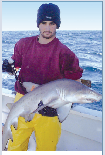
A grey nurse shark tagged with a device to record temperature, depth, light and location.

Researchers also study shark growth rates using crosssections of vertebrae, their reproductive biology, shark movement and use of habitats through tagging studies, genetic identification of shark stocks, and the efficiency of different gear types used to catch sharks.