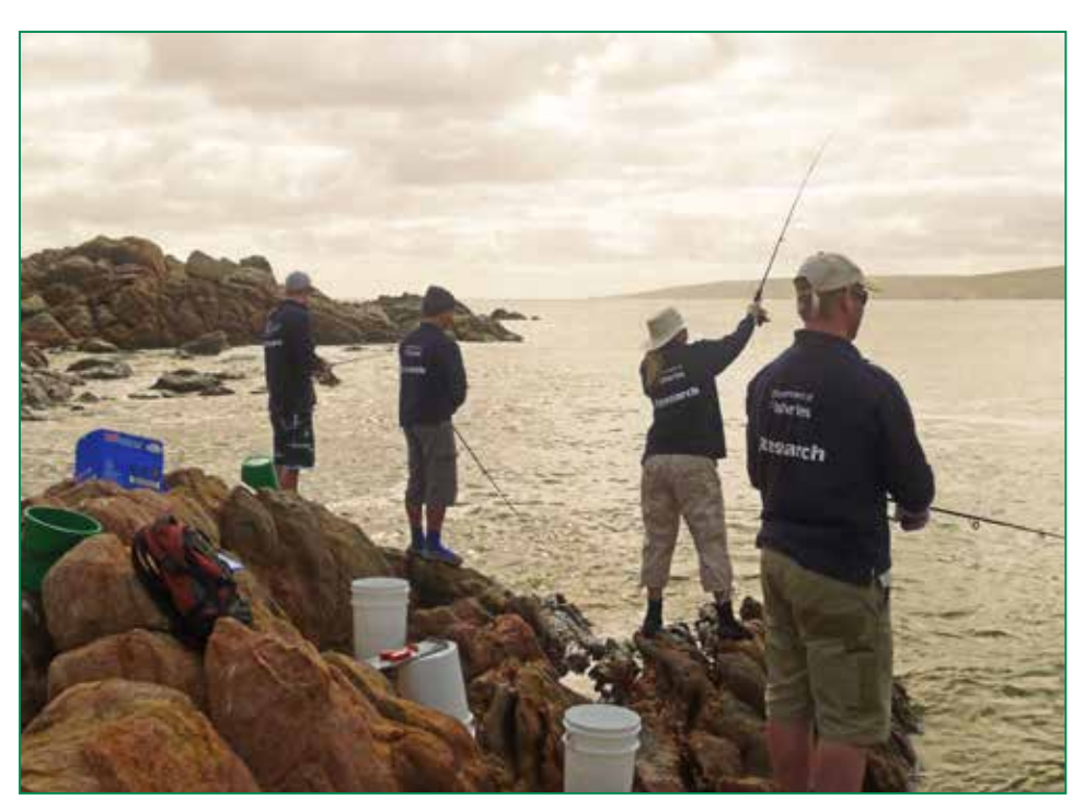
Fisheries researchers catching herring to tag.

Australian herring spawn along the lower west coast of WA (between Perth and Augusta) from late May to early June.