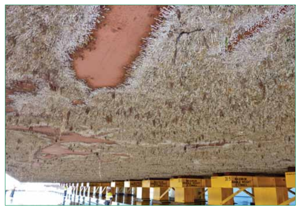
A heavily 'biofouled' commercial vessel hull.

The Minister said the Department of Fisheries, as the lead agency for aquatic pest prevention, had developed new