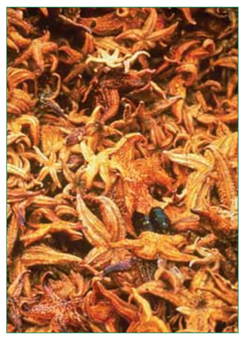
Once established, Northern Pacific seastars can completely take over a marine ecosystem.

For more information about aquatic biosecurity visit www.fish.wa.gov.au/ biosecurity