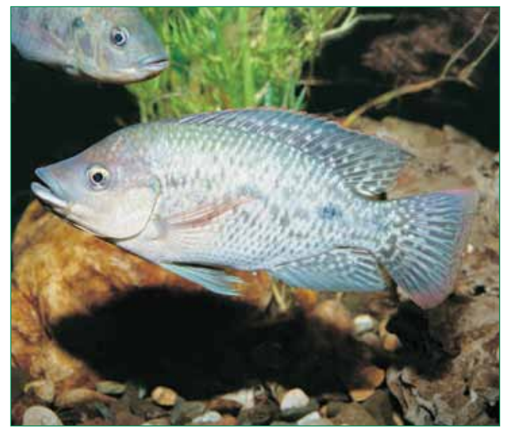
Tilapia are a threat in tropical waterways, breeding rapidly and eating a wide range of food including fish eggs.