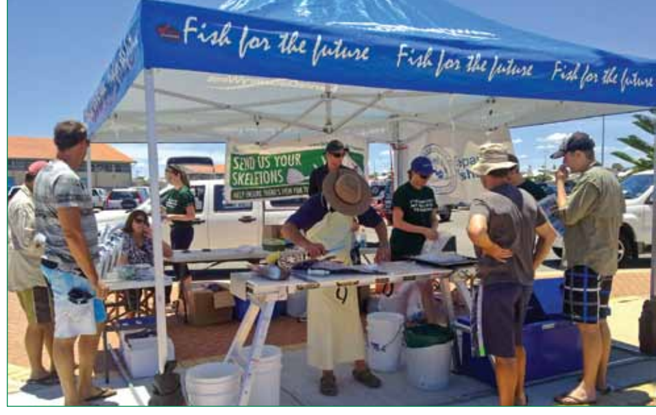
The filleting event was a huge success.

Each winner will receive a RAP floating key ring and stubby holder together with a family pass to the Naturaliste Marine Discovery Centre. Future winners will be published in upcoming newsletters. Make sure you fill out your log book and get your returns in to ensure your chance of winning!