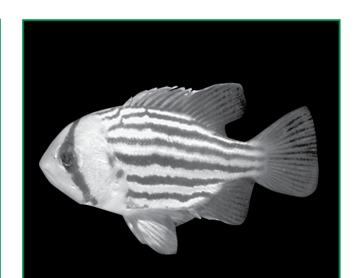
A three-month-old juvenile dhufish measuring just over three centimetres.