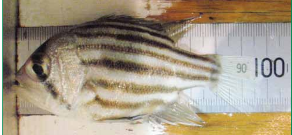
Figure 1. Juvenile dhufish (99mm total length).