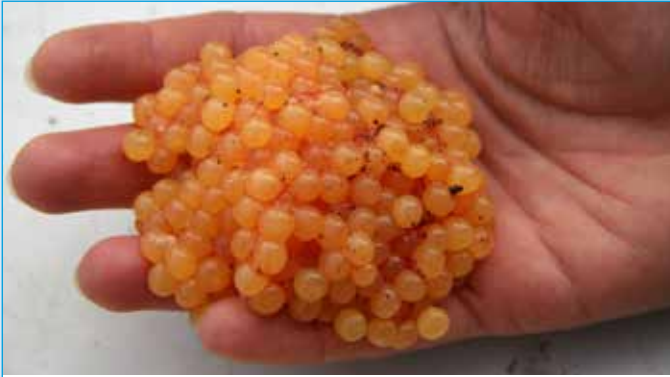
Cobbler produce a small quantity of very large eggs.

Cobbler can complete their lifecycles in marine (ocean) or estuarine waters. The male builds a burrow then lures a female in to lay her eggs. After fertilisation, the male stays in the burrow to protect the eggs while they develop and hatch. The male then continues to protect the young for about a month, until they are developed enough to forage for themselves.