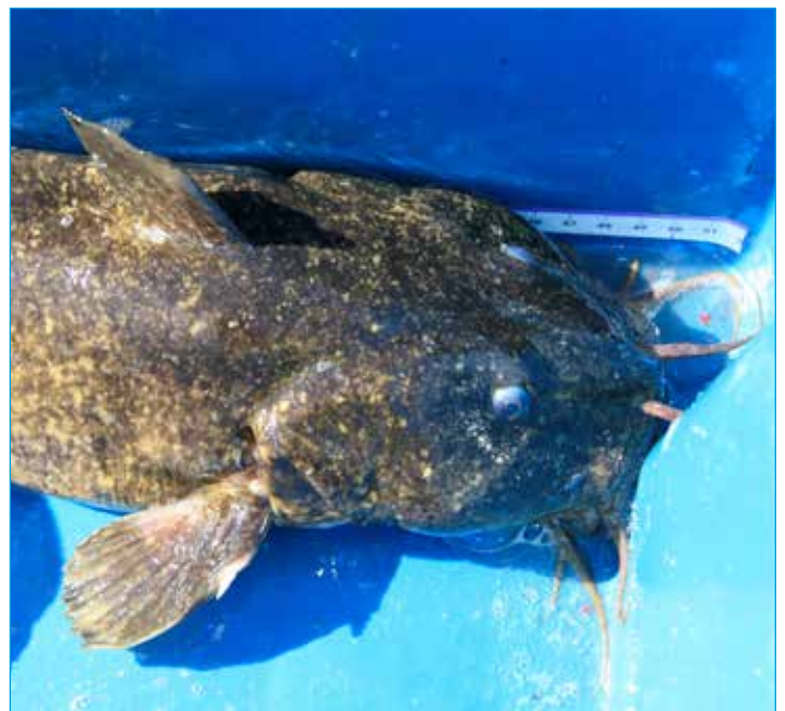
The cobbler has whisker-like barbels to help it find food.

Eutrophication is one of the main causes of hypoxia (low oxygen levels) and anoxia (no oxygen). Eutrophication happens when nitrates and phosphates are added to the water, from fertiliser run-off, for example. This leads to an increase in the growth of plants, especially algae, which can lower oxygen levels.