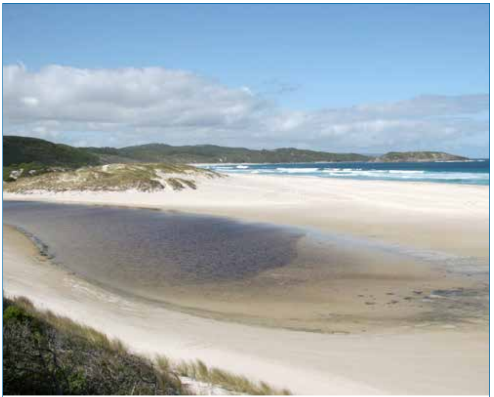
Cobbler thrive in Wilson Inlet, near Denmark, which is not open to the ocean for most of the year.

In areas where the estuary does open to the ocean, like the Swan Estuary, it's believed there are still separate breeding stocks. Historically, it's thought there were two stocks living in the Swan Estuary – the estuarine stock in the upper estuary and an oceanic stock that bred outside of the estuary and then ventured into the lower estuary as juveniles. The estuarine cobbler population in the Swan Estuary dropped to such low levels that, in July 2007, a 10-year fishing ban was implemented in both the Swan and Canning rivers to allow the stock to recover.