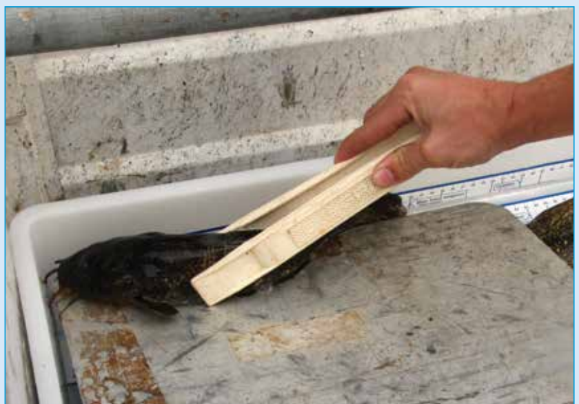
A researcher measures a cobbler.