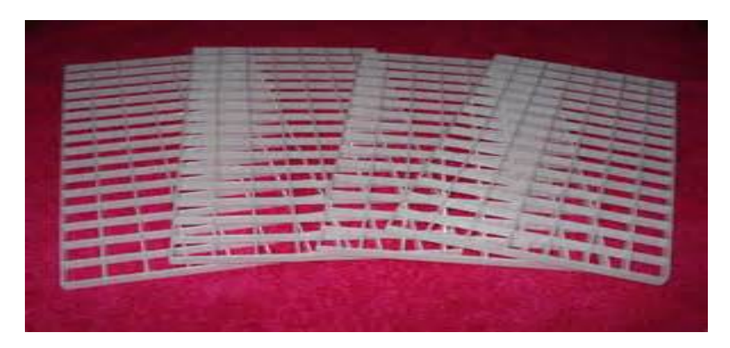
Figure 2: Example of Frag Racks