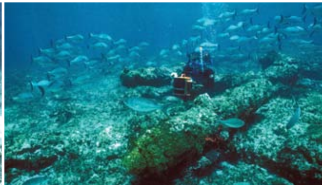
Anchor, hull and cannon from the Batavia .