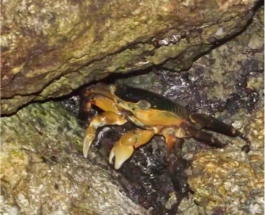
Crab on the stone jetty, Rat Island.

species endemic to WA. There are a higher proportion of tropical species in most groups, but the majority of hydroid (members of the invertebrate order Hydroida ) and sponge species are usually found in temperate, rather than tropical, waters.