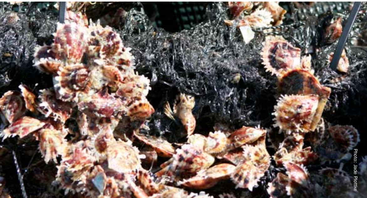
Pearl oyster spat.

The near-pristine waters of the Abrolhos are suitable for aquaculture of a variety of high-value species. Subsequent licences have predominantly been for pearl oyster species, sponges, finfish, coral and live rock.