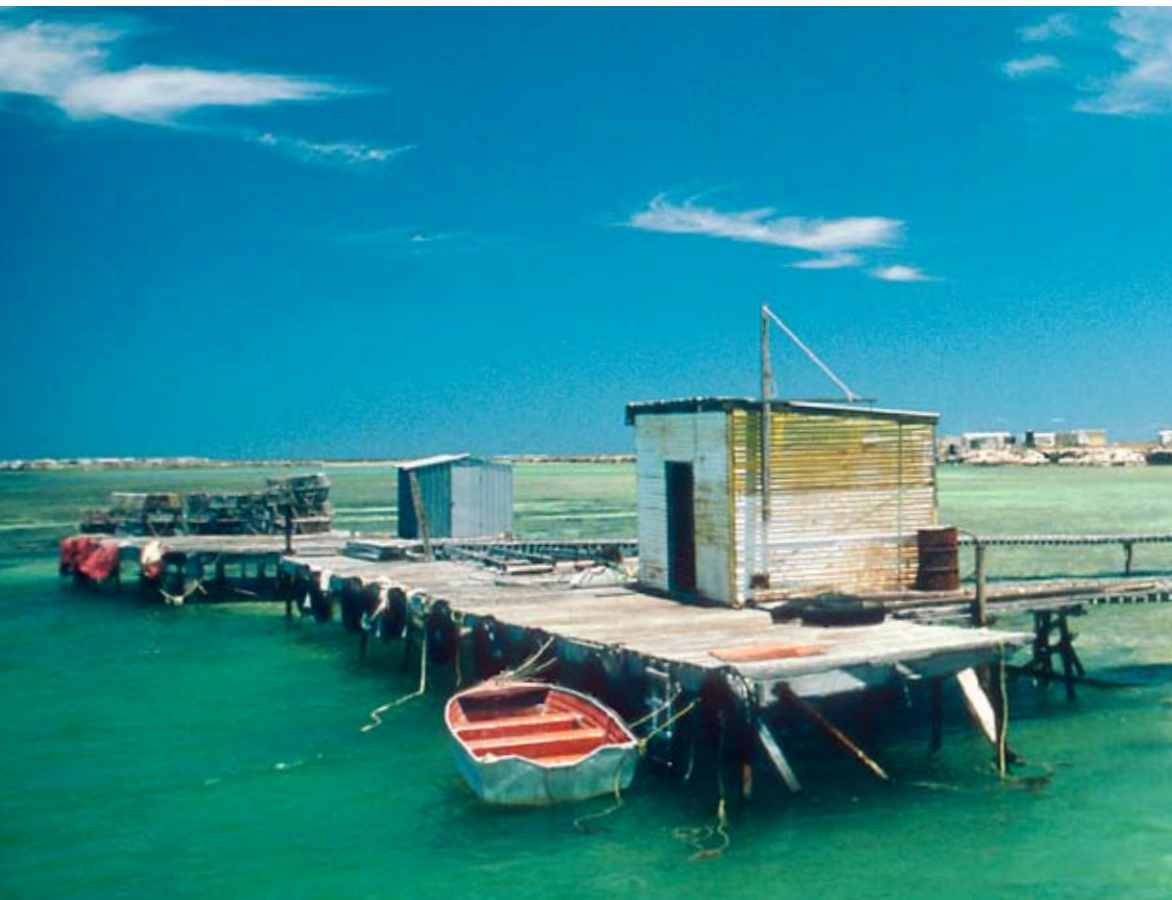
Rat Island in 1983.

Wickham’s account of the marine life in Abrolhos waters inspired the fishing industry in the 1840s – an industry which still exists today.