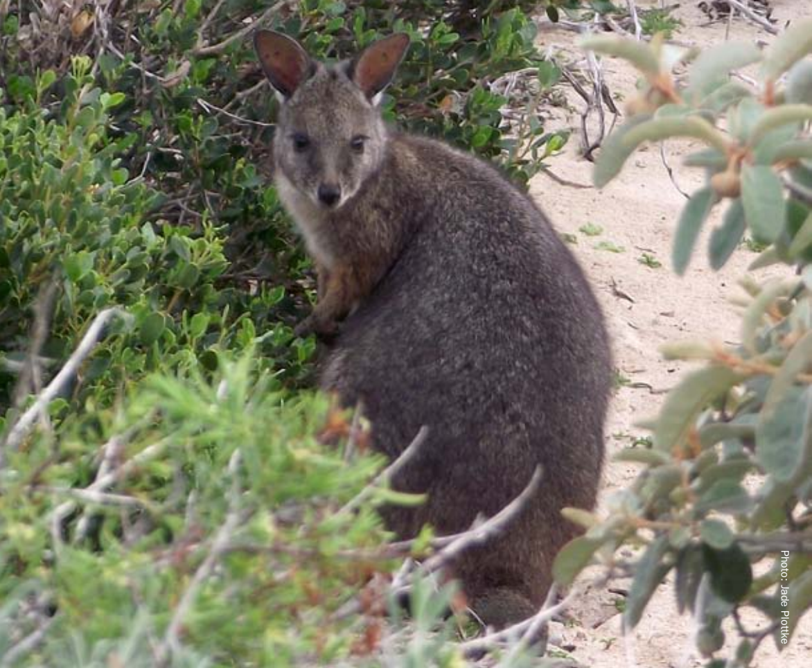
Tammar wallaby on East Wallabi Island.