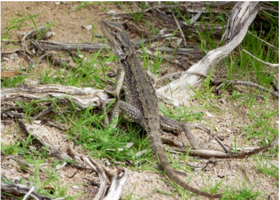
Abrolhos dwarf bearded dragon.