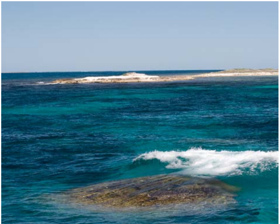
Waves breaking on a submerged reef.