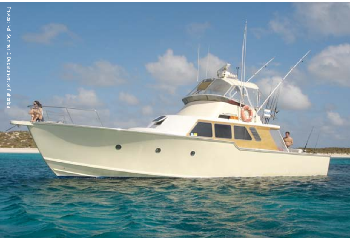
Fishing charter boat.

William Saville-Kent, The Naturalist in Australia , 1897