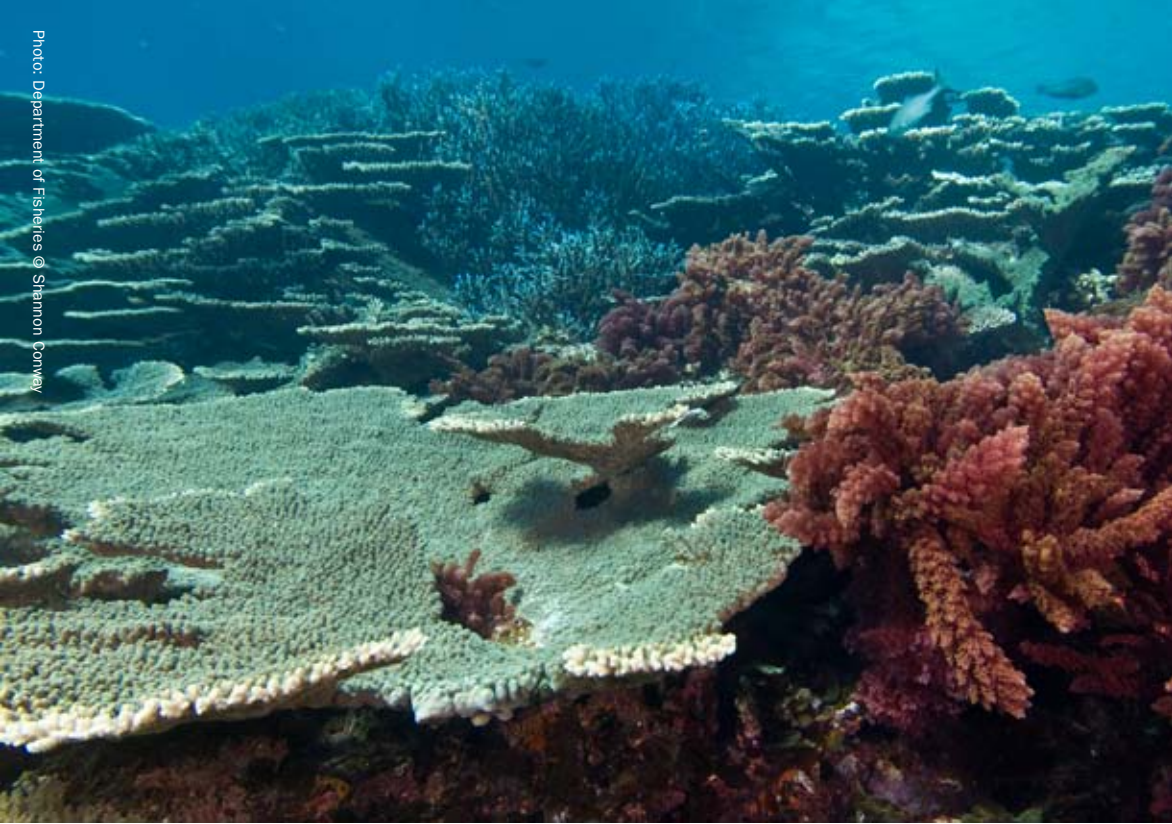
Acropora coral reefs at the Abrolhos.