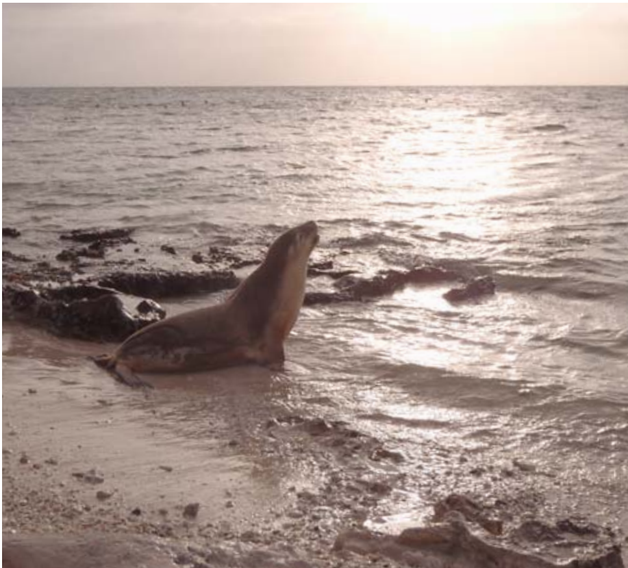
Watching the sunset from Rat Island.

Francisco Pelsaert, Commander of the Batavia