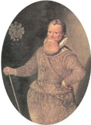
Frederik de Houtman

D espite de Houtman’s advice, many vessels have visited the Abrolhos. Some visited by accident, as shipping traffic driven off-course or through navigational errors. Some visited intentionally, for guano mining, fishing, tourism or defence, and some met their ends at the Abrolhos.