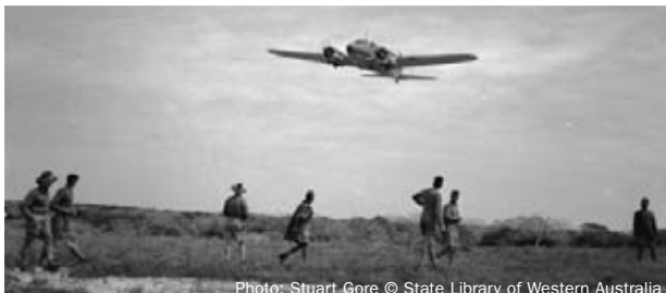
Operations and training exercises on East Wallabi Island, 1942.