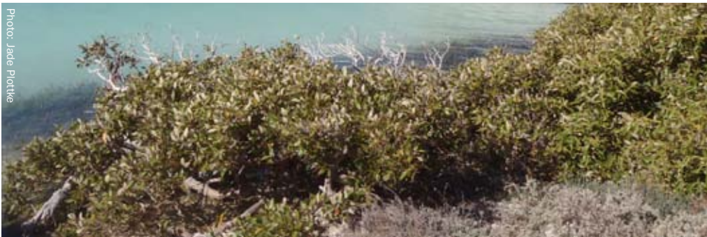
Mangroves on the edge of the lagoon on Post Office Island.