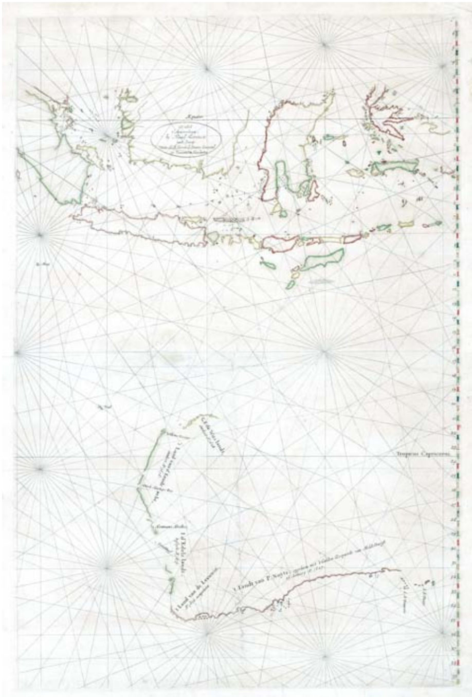
First map showing Houtman's Abrolhos drawn in 1632, by Hessel Gerritsz for the United Dutch East India Company.