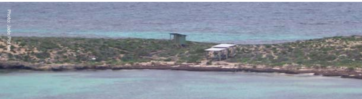
Infrastructure at Turtle Bay.

The Department of Fisheries has installed a large number of dive markers, outlining various dive trails throughout the Abrolhos. These include Turtle Bay, Morley Island and the Coral Patches dive trails.