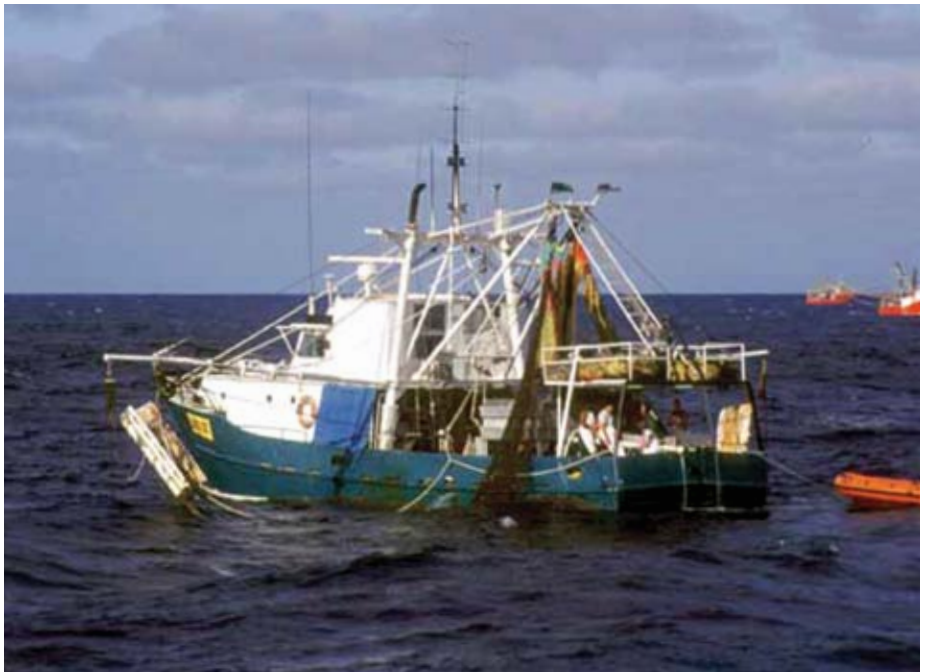
Commercial scallop vessel.