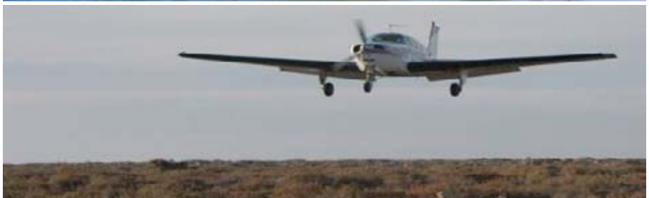
Float plane in 1973 (top). Light aircraft landing at the Abrolhos (bottom).