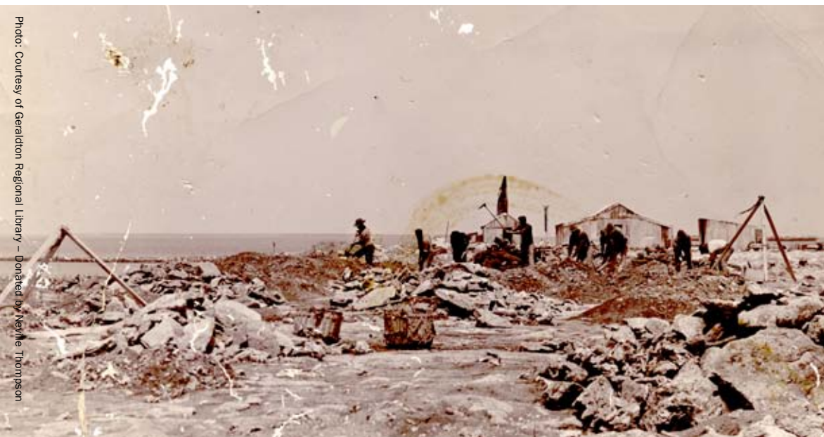
Guano mining at the Abrolhos in the 1890s.

At least five guano ships ran afoul of the reefs and sand bars in the Abrolhos, including the German barque Hadda in 1877.