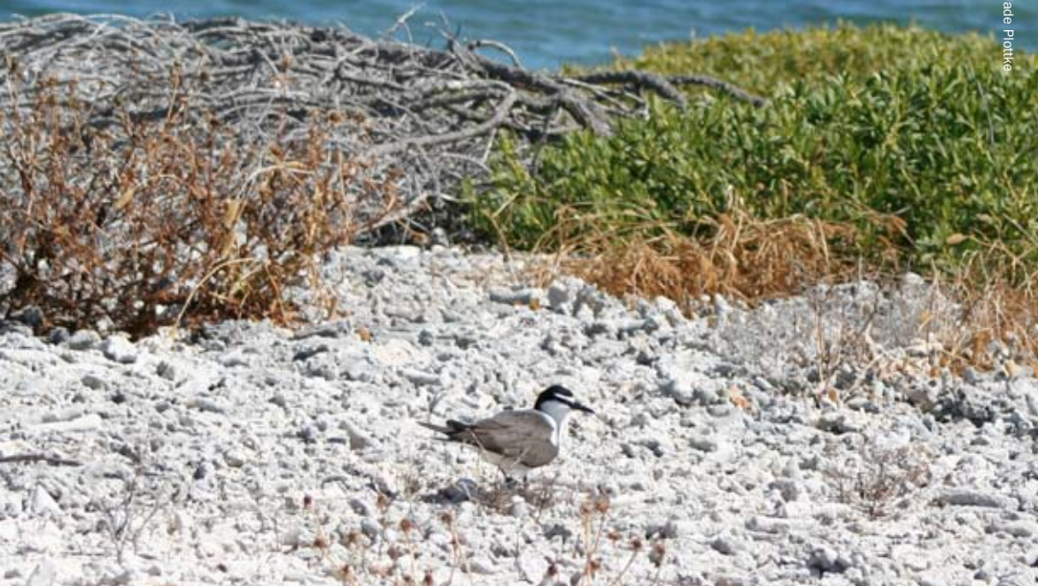
Bridled tern on the coral shingle on Uncle Margie Island.

The three main island groups are located on separate limestone platforms up to 36 m thick with deep channels between these. North Island, which is the northernmost island at the Abrolhos, is on the same carbonate platform as the Wallabi Group. Each platform has a fringing reef system, with a windward reef on the southern and western sides and a leeward reef on the eastern side. These reefs are separated by a central shallow lagoon. The majority of the islands in the Abrolhos have formed within the central lagoons or on the eastern (leeward) reefs.