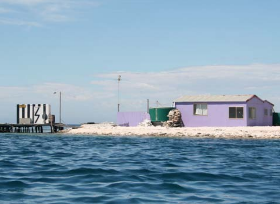
Commercial rock lobster fishing camp on Nook Island, with resident white breasted sea eagle.

It has been estimated that approximately 40 to 50 per cent of the western rock lobster spawning output comes from the Arolhos, therefore conservation of rock lobster habitat and breeding stocks is vital to the entire fishery.