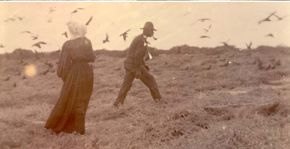
Abrolhos tourists on Pelsaert Island in the 1890s.