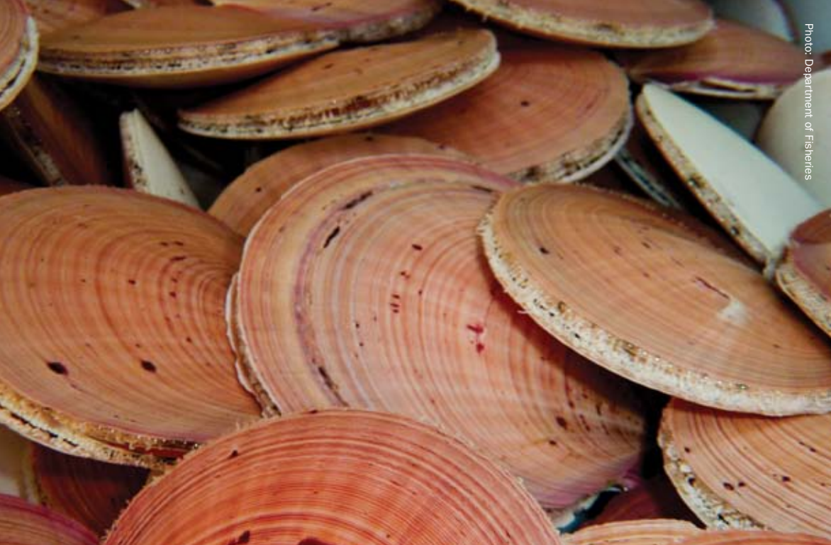
Southern saucer scallop.