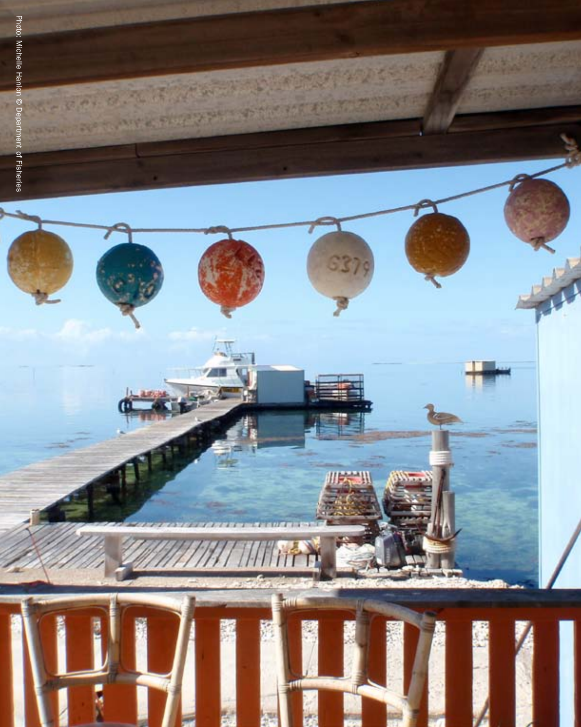
Camp and jetty, Basile Island.