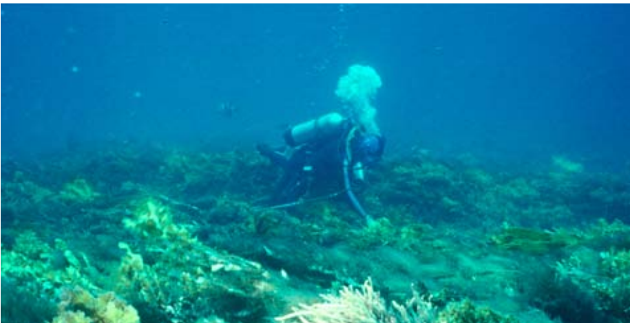
Marine algae at the Arolhos.