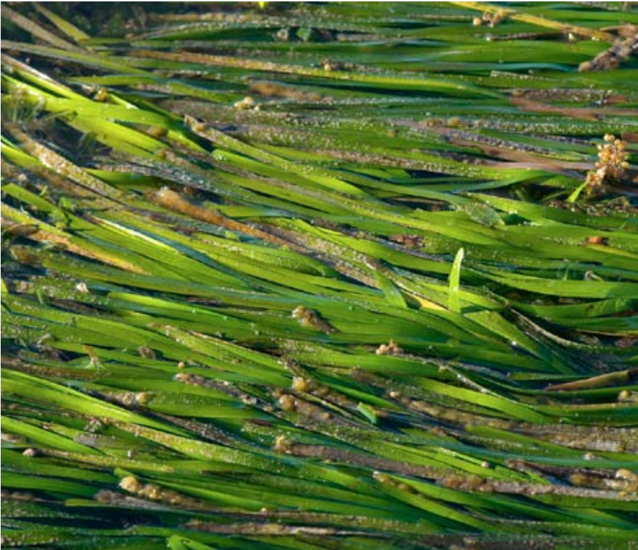
Posidonia , a ribbon-weed found at the Abrolhos.