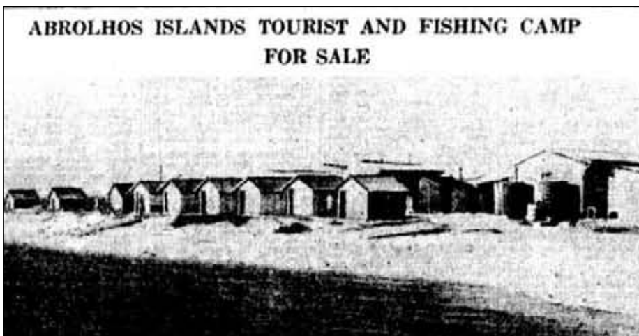
From The West Australian newspaper, 1952.

The majority of the resort has been demolished, though the construction materials can be seen forming parts of fishing shacks on other islands in the Pelsaert Group.