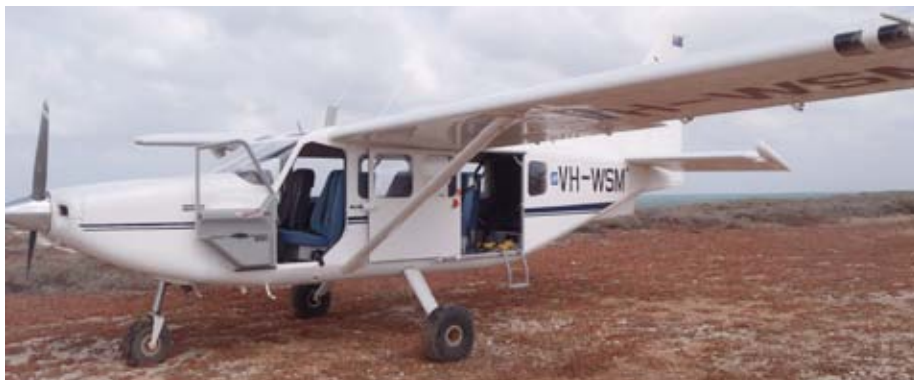
Light aircraft sitting on the airstrip at the Abrolhos

The three fixed-wing airstrips are located at Rat Island, East Wallabi Island and North Island. These assist with the logistical operations of the commercial rock lobster and aquaculture industries, the tourism industry and emergency and government statutory services.