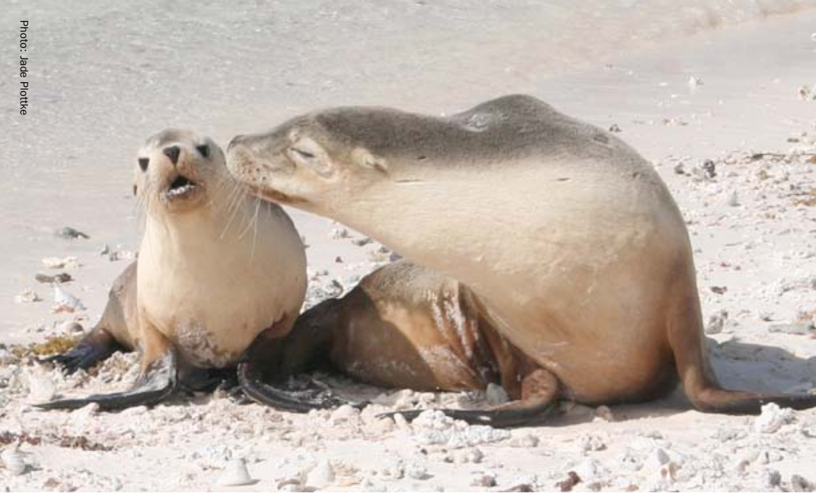
Juvenile and adult female Australian sea lions.