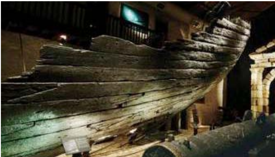
Salvaged part of Batavia on display at WA Museum.

The wreck of the Batavia was discovered in 1963 and extensive archaeological surveys and excavations have since been conducted, both in the water and on land. Most of the artefacts have been removed and conserved by the Western Australian Museum. These artefacts are on display at museums in Geraldton and Fremantle.