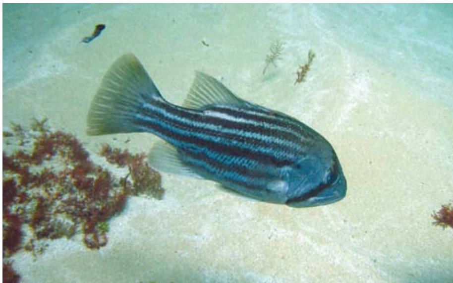
West Australian dhufish.