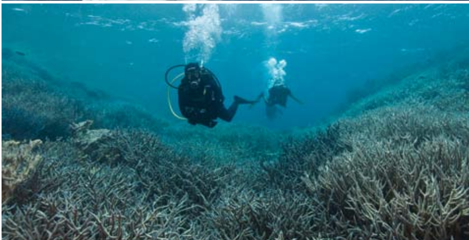
Fishing and diving at the Abrolhos.