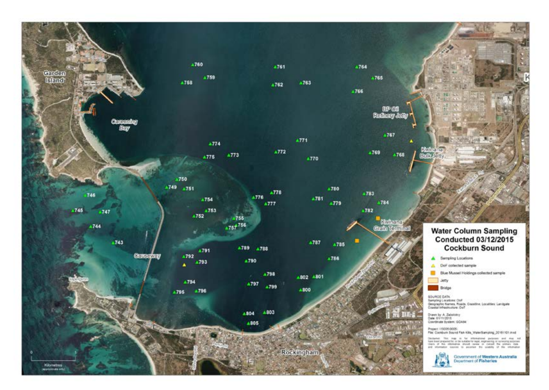
Figure 3. Location of sampling sites for environmental water quality assessment conducted by Department staff.

A systematic survey by Department staff conducted in the southern section of Cockburn Sound on 3 December 2015 did not identify evidence of continuing low dissolved oxygen levels (Figure 3).