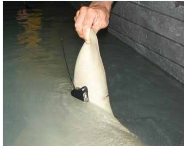
A dwarf sawfish tagged with a satellite device.

Camballin Barrage, 150 kilometres upstream from the limit of tidal influence, is thought to obstruct the upstream migration of juvenile freshwater sawfish during much of the year when the river level is below the height of the weir. Originally built to divert water for farming, the weir is now a fishing and tourism spot.