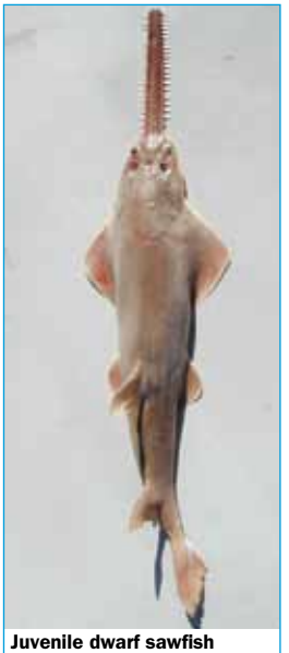
Juvenile dwarf sawfish

Conservation status: Critically endangered (IUCN Red List); totally protected ( FRMA ).