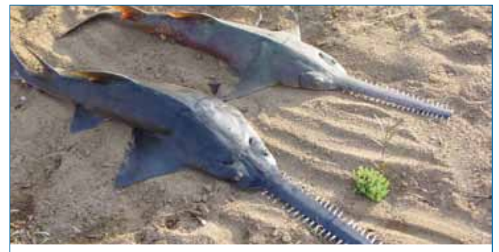
These young freshwater sawfish were caught 150 kilometres upstream from the mouth of the Fitzroy River. They are about to be tagged and released.

Female sawfish produce eggs in their ovaries and these are fertilised by the males' sperm in a duct connecting the ovary to the uterus – rather like the fallopian tubes in humans. Like sharks, male sawfish have special organs called 'claspers' that they use to insert sperm inside the females.