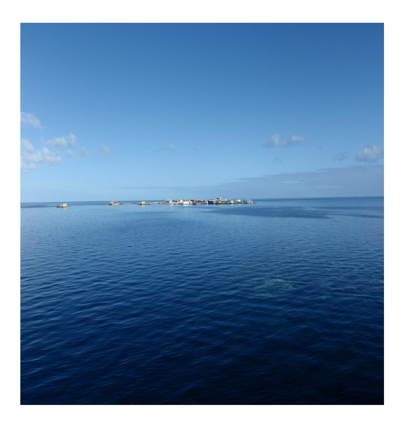
Prepared by Department of Fisheries, Western Australia Version 2.0 – December 2015