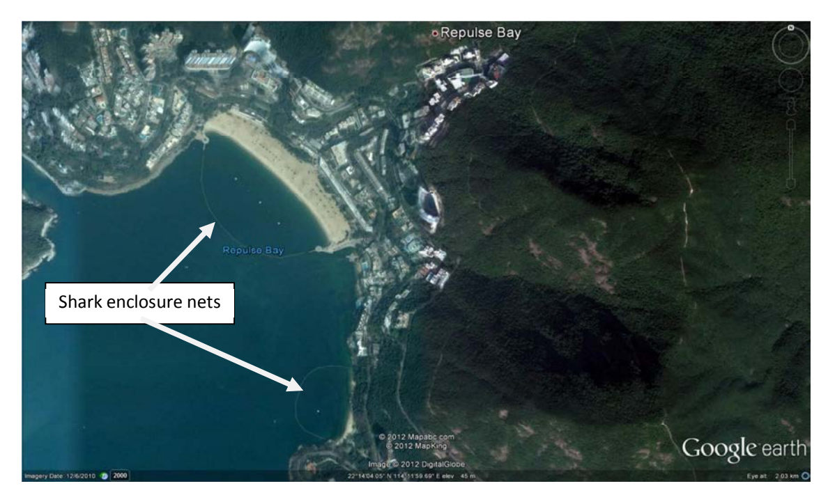
Figure 1 An example of shark exclusion nets in the Repulse Bay area of Hong Kong.

Methods to completely exclude sharks from an area have been employed in a number of locations. Shark exclusion nets are the principal methods of bather protection in Hong Kong since the early 1990s when a series of shark attacks resulted in six fatalities. The nets are in place nine months of the year at all gazetted beaches and there have been no fatalities since their installation. The Hong Kong nets are designed and engineered to withstand 10 metre waves. Beaches in the Hong Kong area are very short stretches of sand interspersed between large rocky headlands meaning that beach activities are restricted to a relatively small part of the coastline. An example of shark exclusion nets in Hong Kong are shown in Figure 1 and the relatively short length of beaches are also illustrated. An average net enclosure would be 500 m long and either semi-circular or rectangular in shape. They are diverinspected a minimum of twice a week, and independent verification is required. They also exclude floating refuse, and clearly define the swimming area.