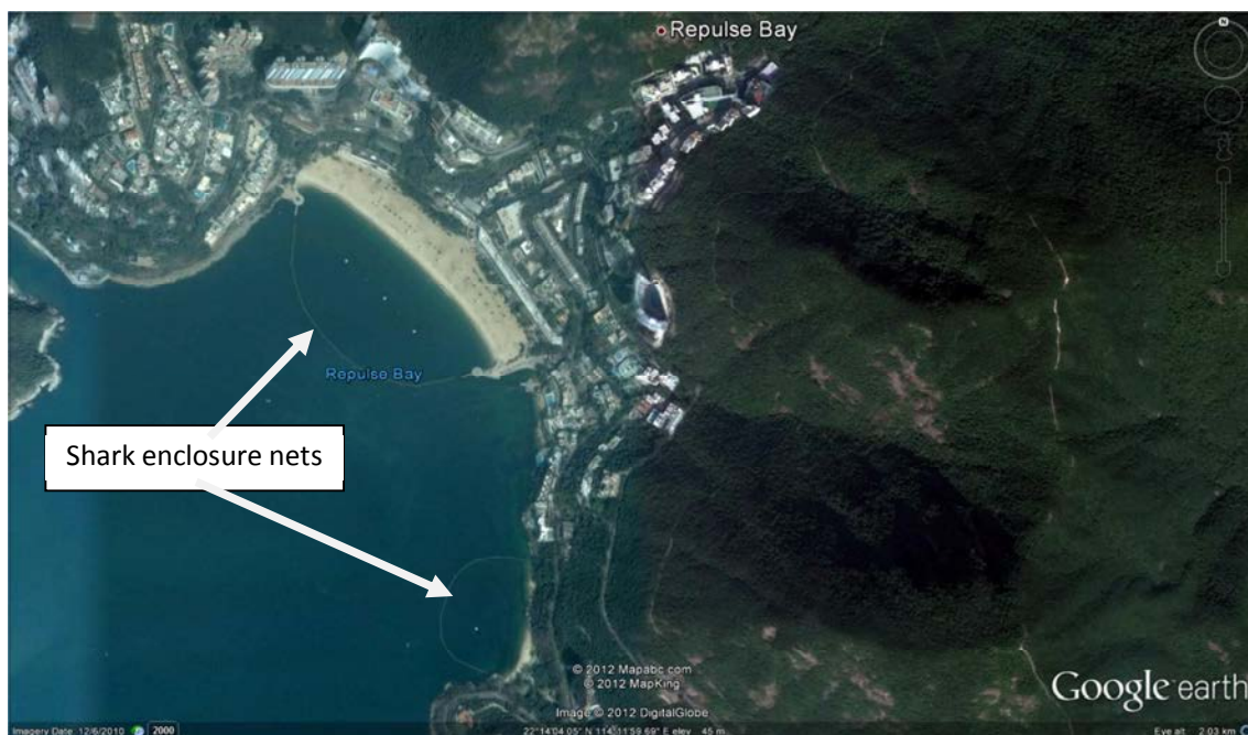
Figure 1 An example of shark exclusion nets in the Repulse Bay area of Hong Kong.

Methods to completely exclude sharks from an area have been employed in a number of locations. Shark exclusion nets are the principal methods of bather protection in Hong Kong since the early 1990s when a series of shark attacks resulted in six fatalities. The nets are in place nine months of the year at all gazetted beaches and there have been no fatalities since their installation. The Hong Kong nets are designed and engineered to withstand 10 metre waves. Beaches in the Hong Kong area are very short stretches of sand interspersed between large rocky headlands meaning that beach activities are restricted to a relatively small part of the coastline. An example of shark exclusion nets in Hong Kong are shown in Figure 1 and the relatively short length of beaches are also illustrated. An average net enclosure would be 500 m long and either semi-circular or rectangular in shape. They are diver-inspected a minimum of twice a week, and independent verification is required. They also exclude floating refuse, and clearly define the swimming area.